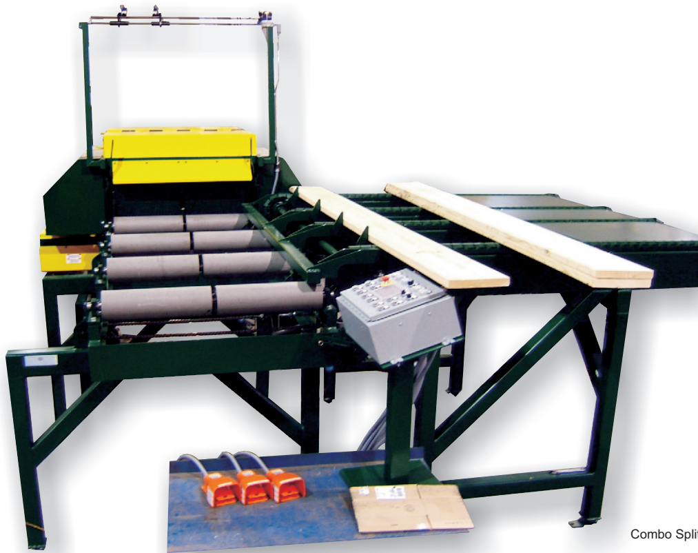
Combo Split Bay Shown